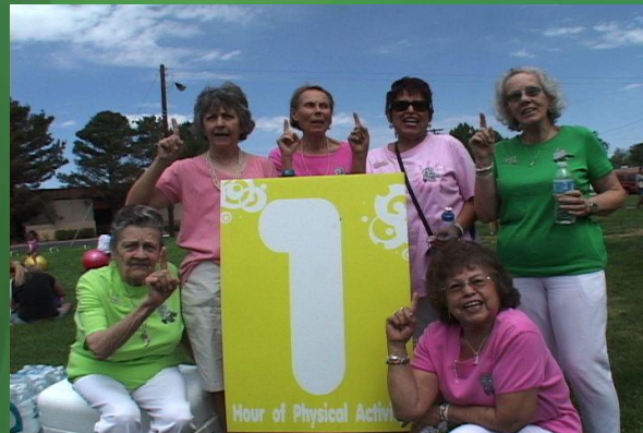
Grant County "Jump Into Summer"