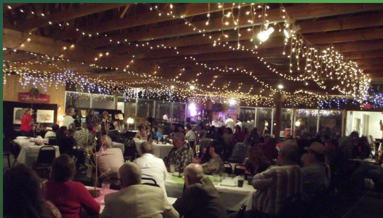
CHANCES Fundraiser- Deming