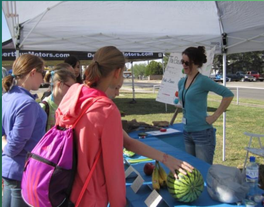
Water Festival - Alamogordo