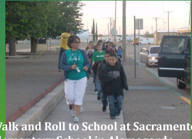
Walk and Roll to School at Sacramento Elementary School in Alamogordo