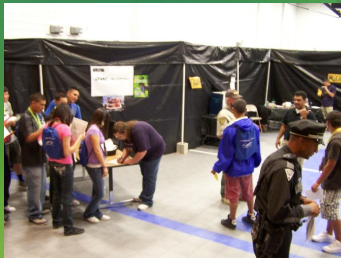
Maze of Life - Socorro