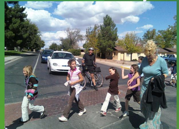
Valley View Elementary garden – Las Cruces