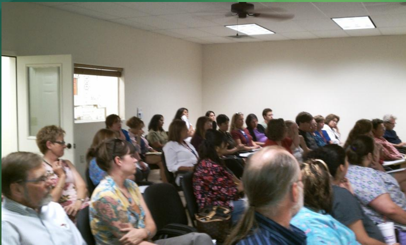
Prescription OD Presentation - Socorro

The Health Promotion Team accomplishes optimal health and wellness through community organizing, which fosters coalitions and networks, strengthens organizational practice and capacity, influences policy and legislation, and identifies and generates resources.