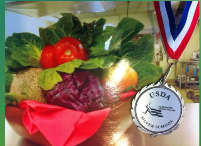
Las Cruces Public School Award – USDA Healthier US Schools Challenge