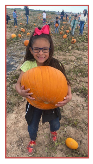
A student at Dexter Consolidated Schools, which earned a Blossom, the second highest award for participating in NM Grown.

Representatives from the Governor's Office as well as the Departments of Agriculture, Health, Public Education, Early Childhood Education & Care, and Aging and Long-Term Services honored all 67 participants in a virtual ceremony in September.