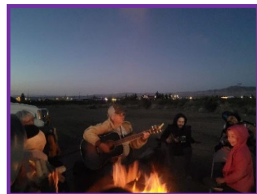
People camped at Veteran's Park during Lordsburg's celebratory kick-off.

The entire process brought the community together to put on a fun celebration and promote the Grinders Trail. The Spirit of Hidalgo received a $95,000, two-year grant to help promote the trail, and multiple organizations offered donations during "Explore Lordsburg Hidalgo County Outdoor Days."