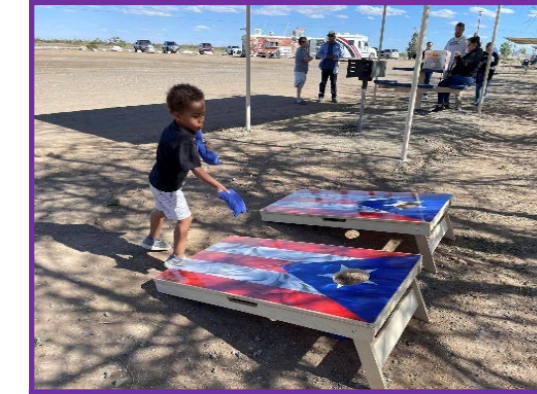
Activities at the celebratory kick-off included cornhole, horseshoes, disc golf, a walking tour, and bike rides as well as drawings for a free drone and bikes!

Enhancing the trail and increasing awareness of the Continental Divide Trail could be a great boon for the Lordsburg area, which is located 20 miles east of the Arizona border. Cox has already talked to bicycling organizations from Tucson and Las Cruces that are ready to ride there.