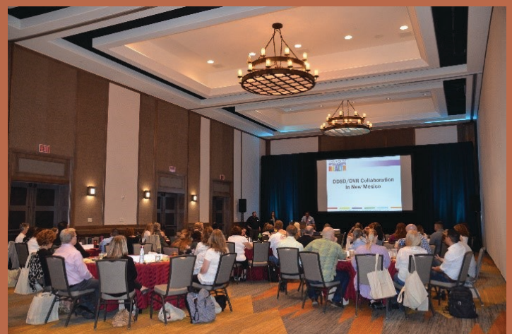
A group photo of attendees at the 2nd Annual Meet at the Mountain-Leadership Summit