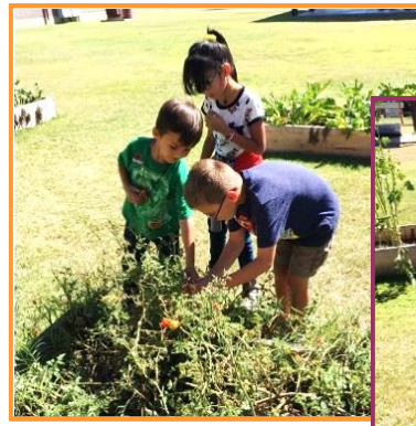
James elementary school garden in Portales