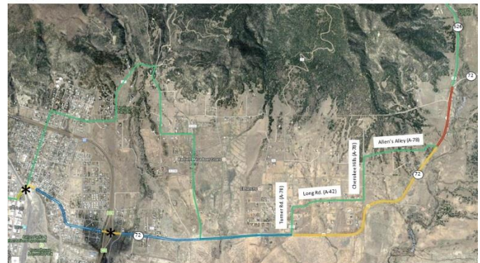
Bicycle/Pedestrian Routes between downtown Raton & Sugarite State Park