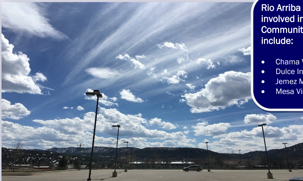
Beautiful views in Dulce, NM.

NE Region Health Promotion staff are committed to the NRACHC and its continued success, and are eager to identify creative ways to support the youth and NCCBS staff.