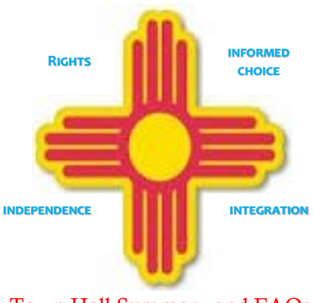
Town Hall Summary and FAQs

The Know Your Rights Campaign Steering Committee was created in November 2016 to provide education and outreach to people with disabilities, family members, advocates and guardians on the Centers for Medicare and Medicaid Services (CMS) Final Rule: Home and Community Based Services (HCBS) Settings Requirements. The Steering Committee is comprised of numerous partners: the New Mexico Allies for Advocacy, the ARC of New Mexico, Case Management Action and Advocacy Council, New Mexico Autism Society, Developmental Disabilities Planning Council, Disability Rights New Mexico, Developmental Disabilities Supports Division, Division of Health Improvement, Governor's Commission on Disability, Human Services Department, Parents Reaching Out, San Juan Center for Independence, Association of Developmental Disabilities Community Providers (ADDCP), Family Living Provider Association, UNM/Center for Development and Disability, NM Equality, and the Attorney General's Office. One of the actions led by the Steering Committee was hosting 10 Know Your Right Town Halls across the state from February to April 2017.