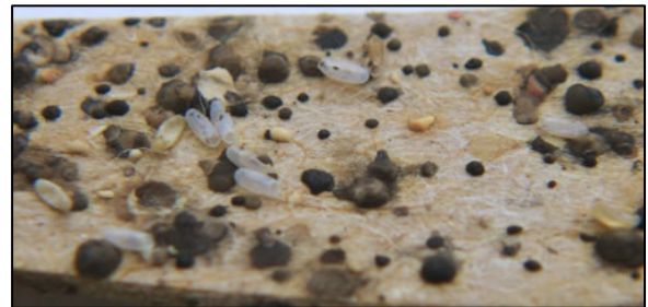
Bed bug droppings and egg shells.