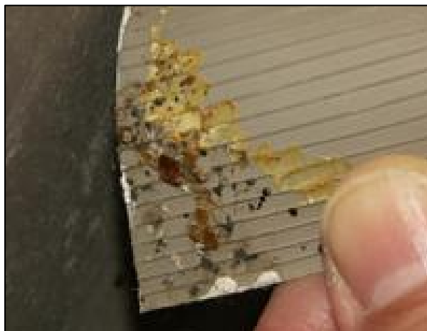
Bed bugs and residue on back of vinyl molding.

Prevent the spread of bed bugs by following these steps and talking about it. Ask for help!