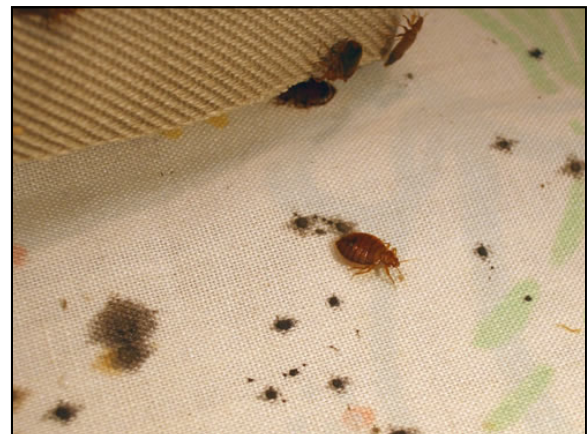
Bed bug adult and droppings on a mattress.