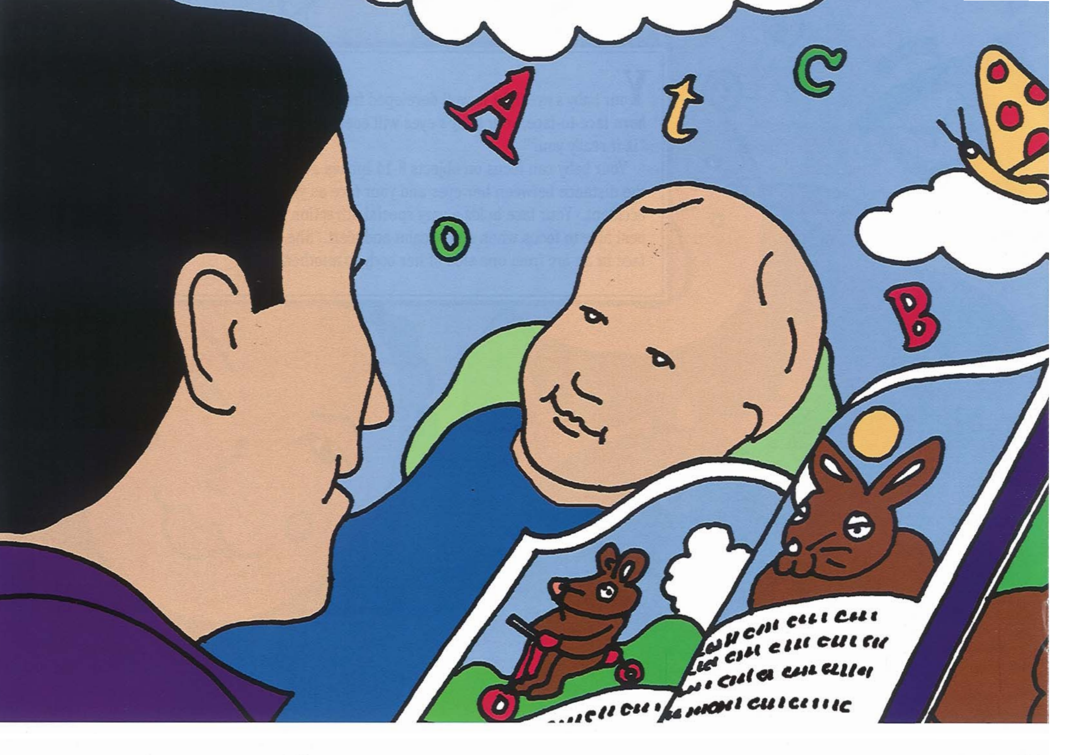
When it comes to reading you may think I'm too young; this is not the time! But it's