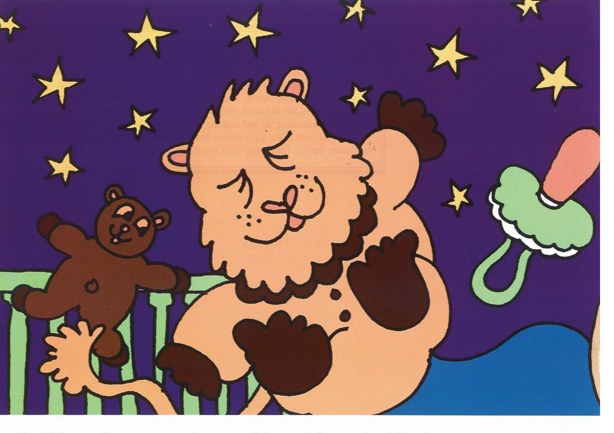
And I love when you comfort me. It's good for my health. And one very nice way to