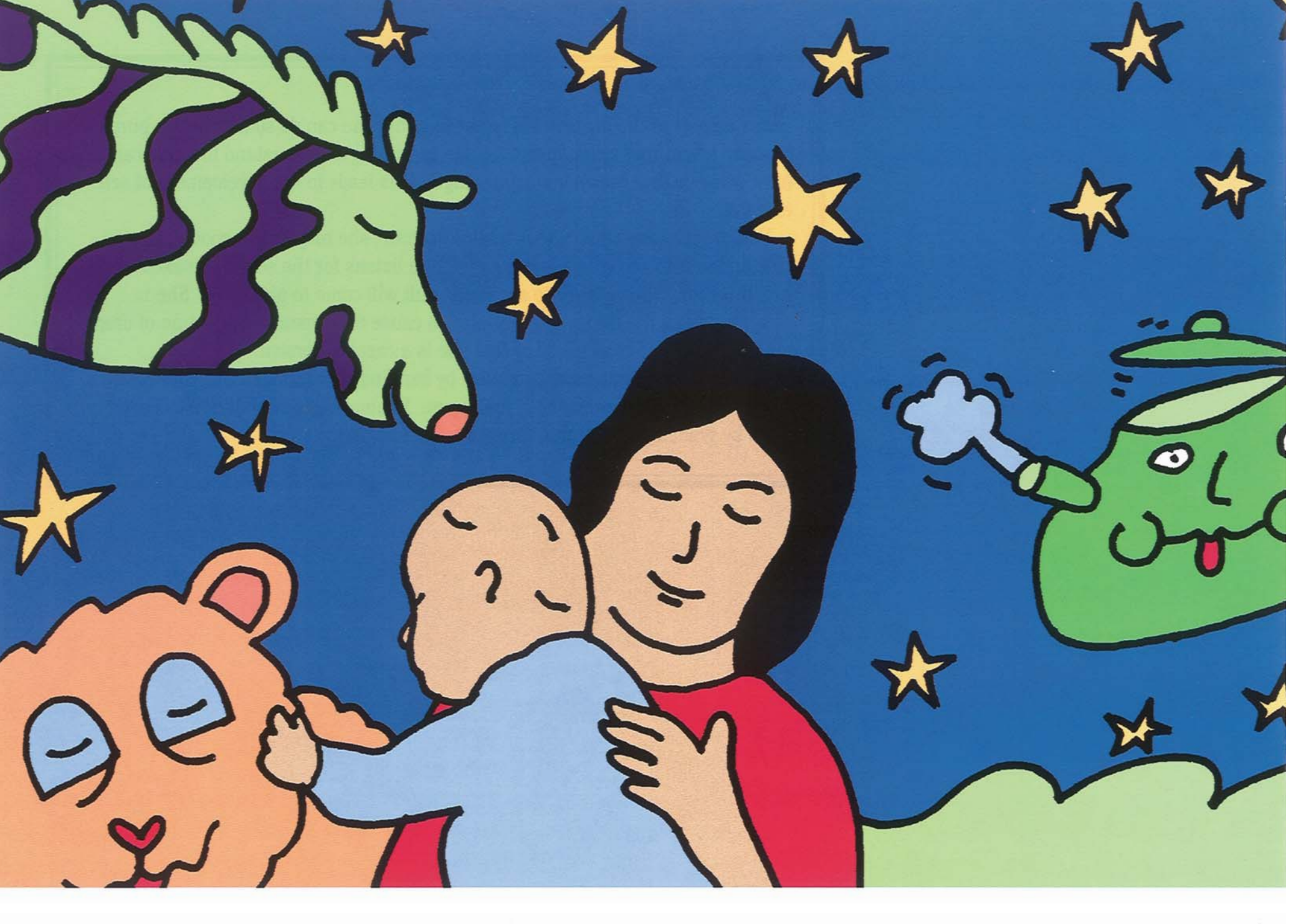
If you find I keep crying at the end of most everyday, this is probably not serious