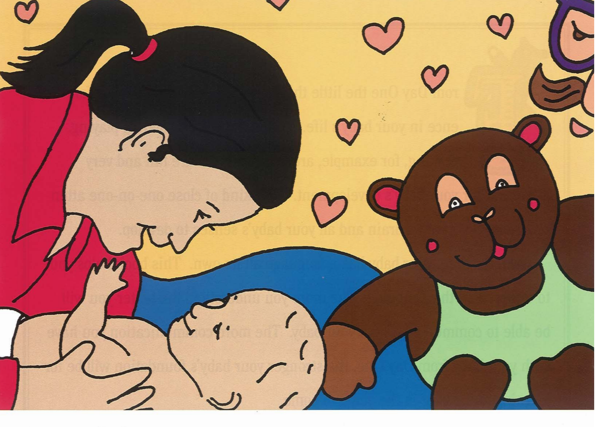
As soon as I'm born I can see and it's your face, mom and dad's, that are most special