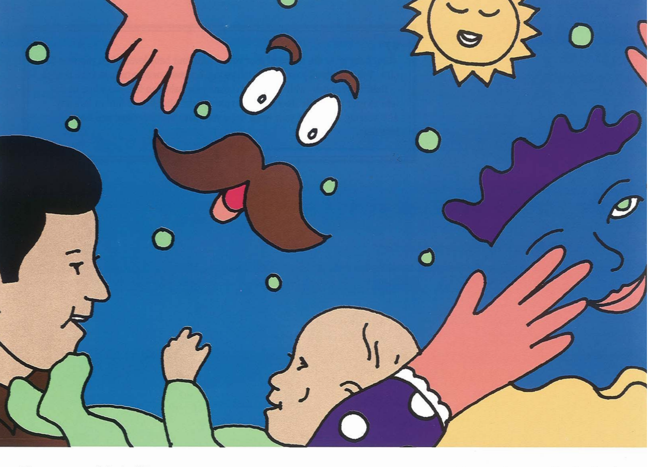
You may think "Peek-a-boo" is fun to play. I know! But did you know that playing