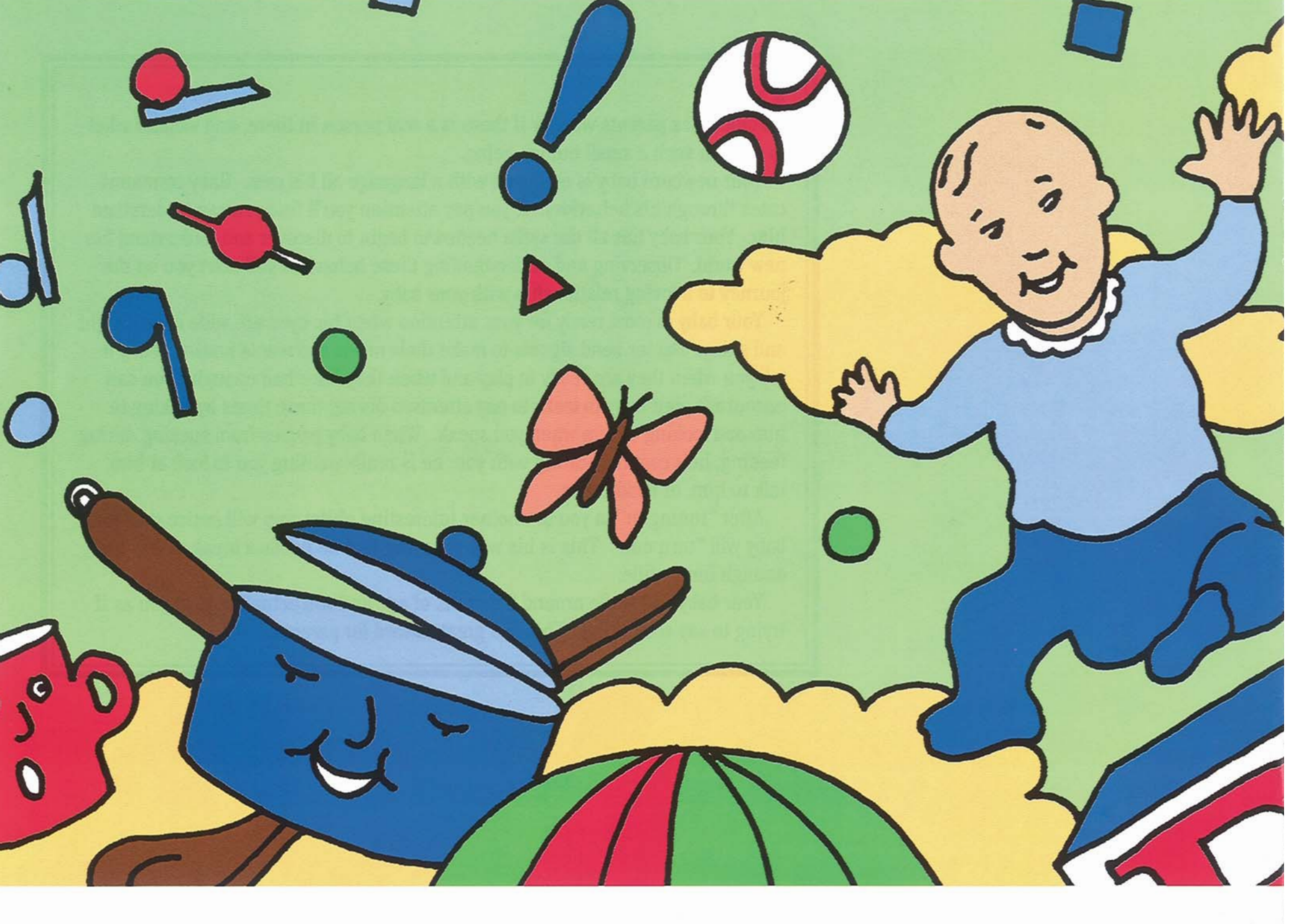
I love to drop toys, turn knobs and even scream. When I do all these things it's more