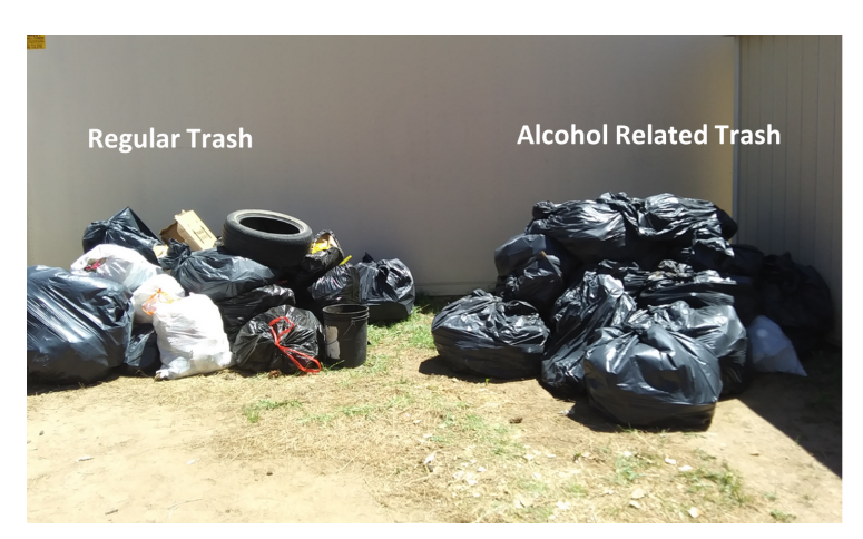
May 1, 2021, Mora Clean Up Day. The left side is regular trash and the right-side is alcohol related trash.

Special thanks go to all the community members who participated, Mora County Sheriff, Mora Creative Council, Mora Valley Community Health Services, Inc., Mora DWI Program, and all Mora Health Council Members for making the May 2021 Clean Up Day a success. By showing how much alcohol related trash is being discarded on County Roads in Mora, they are helping to keep Mora County beautiful and litter free. The next steps for the health council is to report the survey findings to key community partners and plan for further Clean Up Day events.