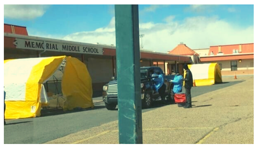
Find out more about the testing registration website at: https://cvtestreg.nmhealth.org