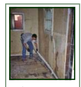
For large areas, consult with remediation professionals.